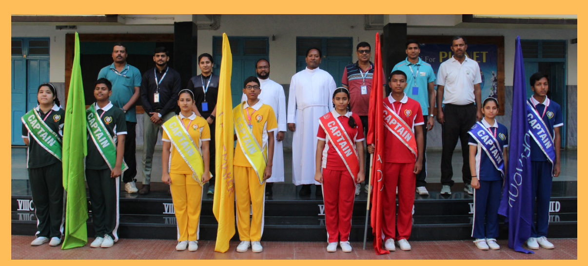
SENIOR SECTION, RANITALAB CAMPUS