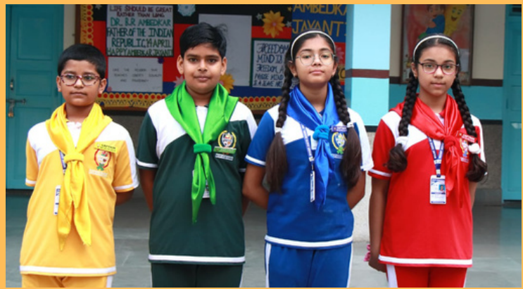
JUNIOR SECTION, BHAGALPUR CAMPUS