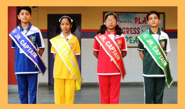
JUNIOR SECTION, RANITALAB CAMPUS